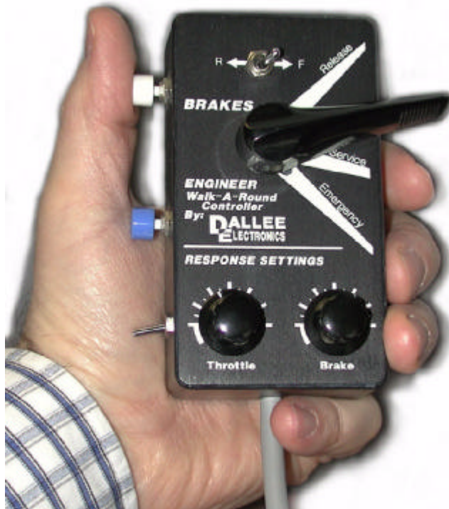
WALK-A-ROUND with Sound Control option shown.

The WALK-A-ROUND attachment for the ENGINEER throttle duplicates the BRAKE switch, THROTTLE RESPONSE, BRAKE RESPONSE, and REVERSE switch of the ENGINEER. To activate the WALK-A-ROUND follow these instructions: