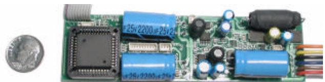
measures 4.5" l X 1.25"w X 0.8"h

fits those tight spaces in "G", "O", and most "S" gauge locomotives