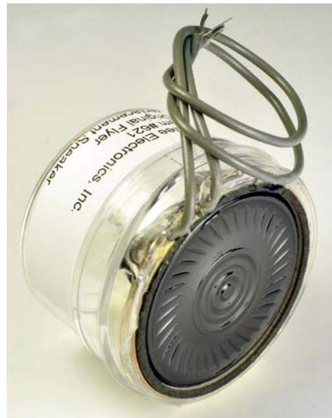
Replacement unit, item #621.

Item #621 comes completely assembled and ready to replace the original speaker, power resistor, and coupling capacitor. It's also supplied with tape for securing it in the same location and orientation as the original unit.